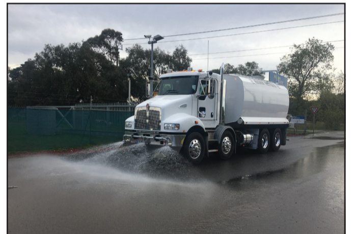
Photo 5 Magnum water truck in operation

AA RADIO SERVICES "We have a long-standing relationship, and admire their commitment to supporting the local community at all times through jobs and local activities... Without access to a quarry of this type, managed by an experienced operator like Conundrum, construction work, the development of infrastructure and flow on benefits will be lost to us."