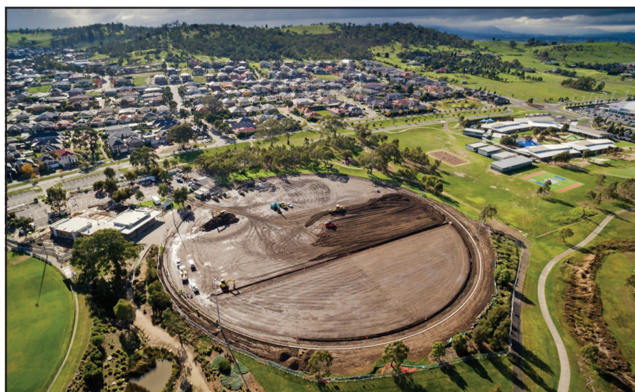
Photo 6 18,600T of material used at Mill Park Lakes

JOSLYN CONTRACTING PTY LTD "Joslyn Group now is recognised as one of Australia's leading sports field builders. Northern Quarries are integral to the delivery of these projects that has resulted in repeat and referred business due in part to the quality of our construction... All projects at some stage will use products sourced from Conundrum Holdings as part of our works."