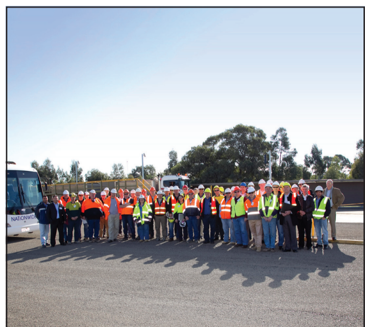
Photo 3 Northern Quarries industry training workshop

BOX HILL INSTITUTE OF TAFE "Conundrum allow us to run training courses on both their Epping and Stawell quarry sites... it enables workers from regional quarries greater access to training. Without Conundrum's support there would be a reduced level of competently trained and assessed workers in the industry throughout Regional Victoria."