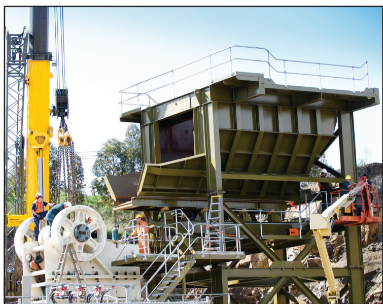
Photo 4 Northern Quarries primary crushing station

H.KANDELAARS ENGINEERING (AUS) PTY LTD "Our company has been conducting business with Conundrum Holdings Pty Ltd for over 15 years. Like ours, their company is a family-owned business... We view opening a new quarry in the Wallan area to be of great benefit to our company and our ongoing working relationship with Conundrum."