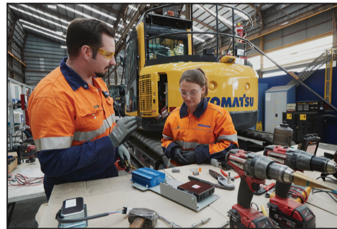
Photo 2 Komatsu apprenticeship training

ALMIC PLUMBING AND DRAINAGE PTY LTD "We have been in the plumbing/construction industry in Campbellfield, since 1998. Such a quarry is imperative to our company operations, and the 20 families it feeds - let alone all the families in our industry."