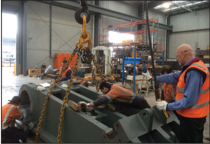
Photo 1 Terex Jaques rebuilding jaw crusher

SYMPHONY WIRE PTY LTD "This type of project creates foundation jobs - every job a quarry creates supports a local ecosystem that in turn supports other jobs and industry sectors... Australian owned and operated specialist manufacturer...Symphony Wire (and all the Australians we employ along with our local suppliers) relies heavily on these kinds of projects going ahead."