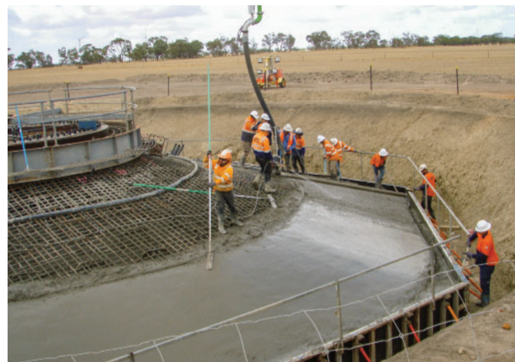
Conundrum supplied over 270,000 tonnes of material for the construction of 99 wind turbines, over 2700T per turbine. Photo: 2021