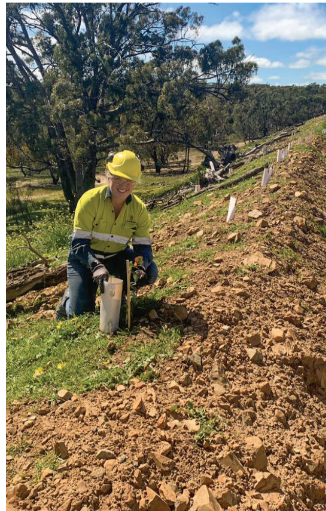
Trees planted as part of Conundrum's rehabilitation program at Stawell Quarry. Photo: 2022